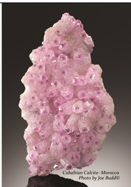
Cobaltian Calcite- Morocco

Like us on facebook - facebook.com/mzexpos